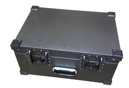
Hard Case (IATA Carry-on Compliant)