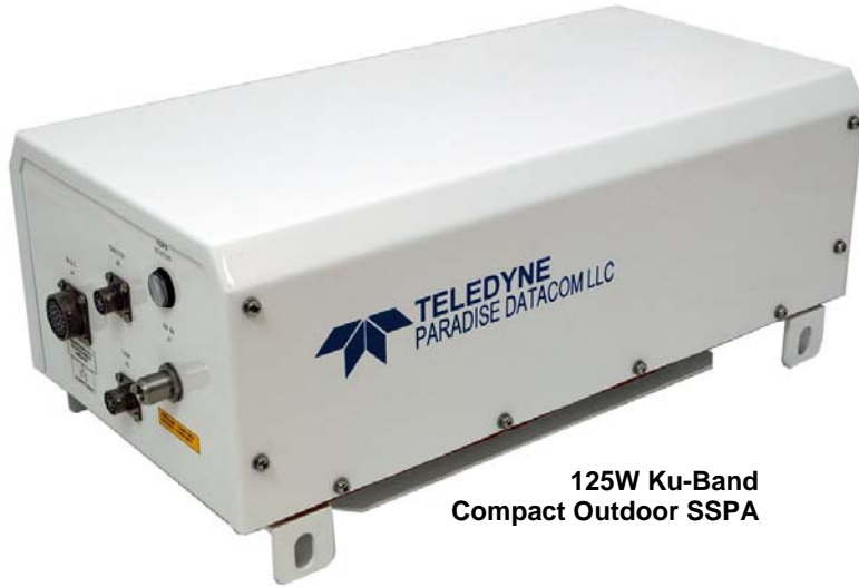
125W Ku-Band Compact Outdoor SSPA