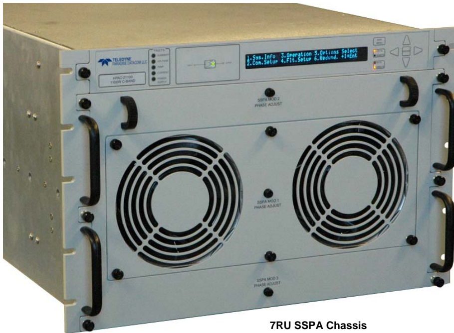
7RU SSPA Chassis