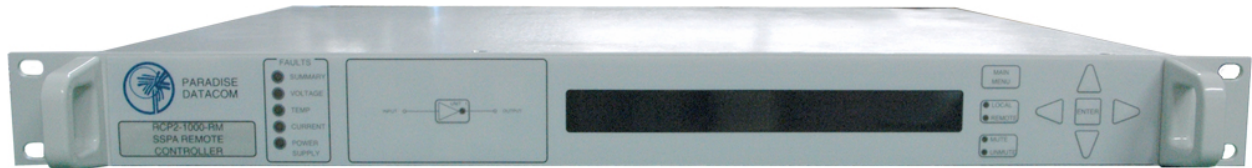
RCP2-1000 Remote Control Panel for Rack Mount SSPAs