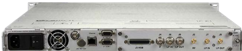
Typical Back Panel

The converters use our patented "Daisy Chain" integrated switching technology. The Daisy Chain design removes the relays associated with a centralized protection switch tray and distributes them across the individual converters. Daisy Chain technology successfully eliminates a central switching chassis, two power supplies, a microprocessor, and several long, costly cables. Widely accepted in the industry, Comtech EF Data's Daisy Chain provides both pricing and marketing advantages.