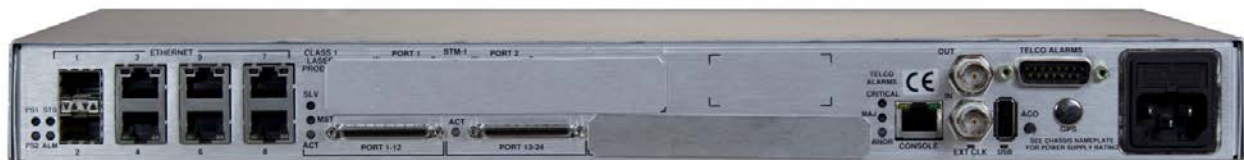
CXU-810-16E Back Panel