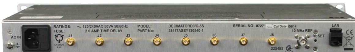
Spectrum VUE-8 Back Panel