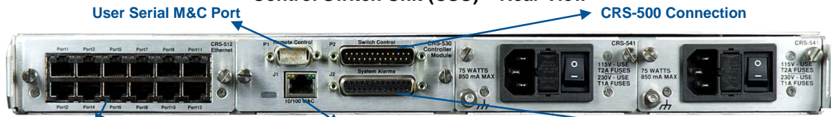
Control Switch Unit (CSU) – Rear View