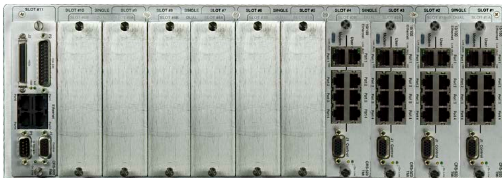
Data Switch Unit (DSU), Front View