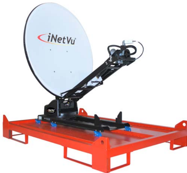
(Shown with the iNetVu 1200 antenna system and shock absorbers)

The iNetVu Transportable Skid is a robust transportable base which is designed to support the iNetVu 1200 antenna system. The skid can be transported using forklifts or hoists making it possible to rapidly deploy the antenna system without the need to mount it on a trailer or a vehicle.