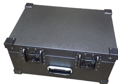
Hard Case (IATA Carry-on Compliant)